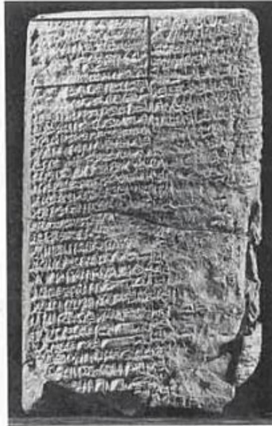
PLATE IX ENLIL SEPARATES HEAVEN AND EARTH (For description, see page 36.)

Gilgamesh: "Him who has four sons hast thou seen!"