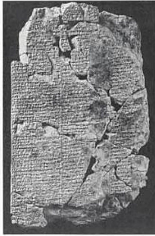
PLATE XV INANNA AND ENKI: THE TRANSFER OF THE ARTS OF CIVILIZATION FROM ERIDU TO ERECH (For description, see opposite page.)