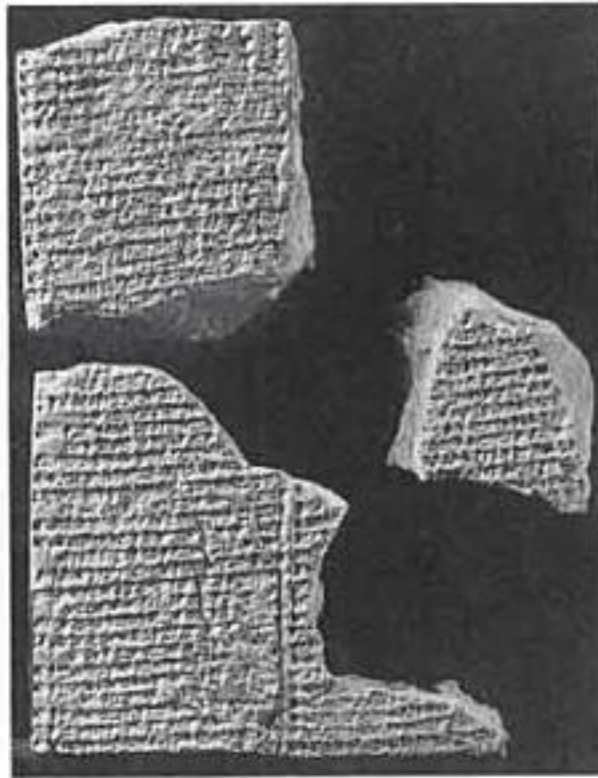
PLATE XVII THE CREATION OF MAN (For description, see opposite page.)