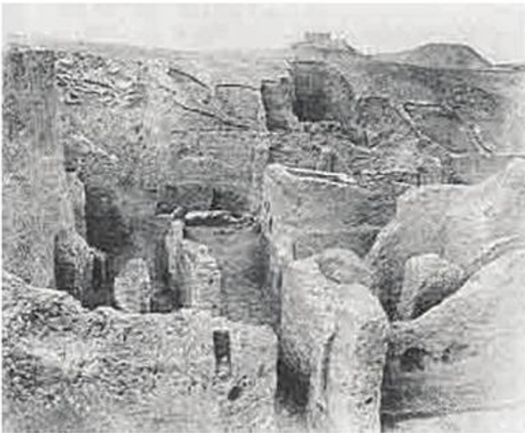
PLATE I A SCENE FROM THE NIPPUR EXCAVATIONS: ROOMS OF THE "TABLET HOUSE."

The ruins of Nippur, among the largest in southern Mesopotamia, cover approximately 180 acres. They are divided into two well-nigh equal parts by the now dry bed of the Shatt-en-Nil, a canal which at one time branched off from the Euphrates and watered and fructified the otherwise barren territory through which it flowed. The eastern half contains the temple structures, including the ziggurat and the group of buildings which must have formed the scribal school and library; it is in this part of the mound that the "tablet house" was excavated. The western half seems to mark the remains of the city proper. 7