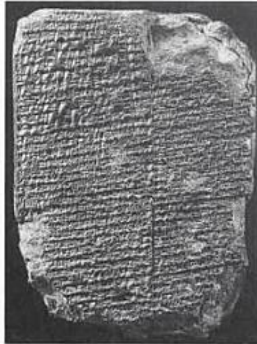
PLATE XI. ENLIL AND NINLIL: THE BEGETTING OF NANNA (For description, see opposite page.)