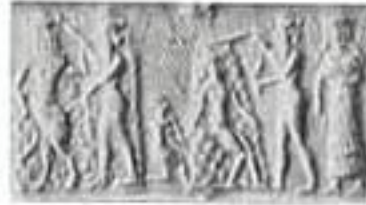
PLATE VII GODS AND THE NETHER WORLD (For description, see opposite page.)

this clue as a guide I succeeded in piecing together the first part of this poem; this was published in 1938. 34 The latter half of the poem still remained largely unintelligible, and even the first and published part had several serious breaks in the text. In 1939 I found in Istanbul a broken prism inscribed with the poem. And in the course of the past year I identified and copied 7 additional pieces in the University Museum at Philadelphia. 35 As a result we now have 16 pieces inscribed with the poem; over two hundred and fifty lines of its text can now be intelligently reconstructed and, barring a passage here and there, be correctly translated.