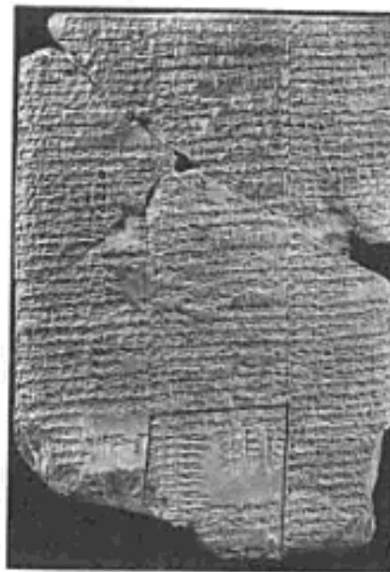
PLATE XIII. ENKI AND NINHURSAG: THE AFFAIRS OF THE WATER-GOD (For description, see opposite page.)