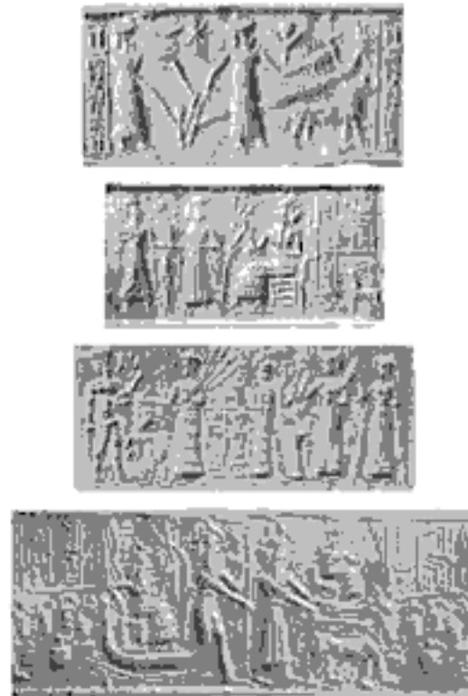
PLATE XII GODS OF VEGETATION (For description, see opposite page.)

(Reproduced, by permission of the Macmillan Company, from Henri Frankfort, Cylinder Seals , plates XXa, d, e, and XIXe.)