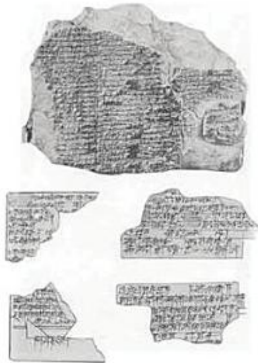
PLATE XVI INANNA AND ENKI: THE TRANSFER OF THE ARTS OF CIVILIZATION FROM ERIDU TO ERECH (For description, see page 64.)