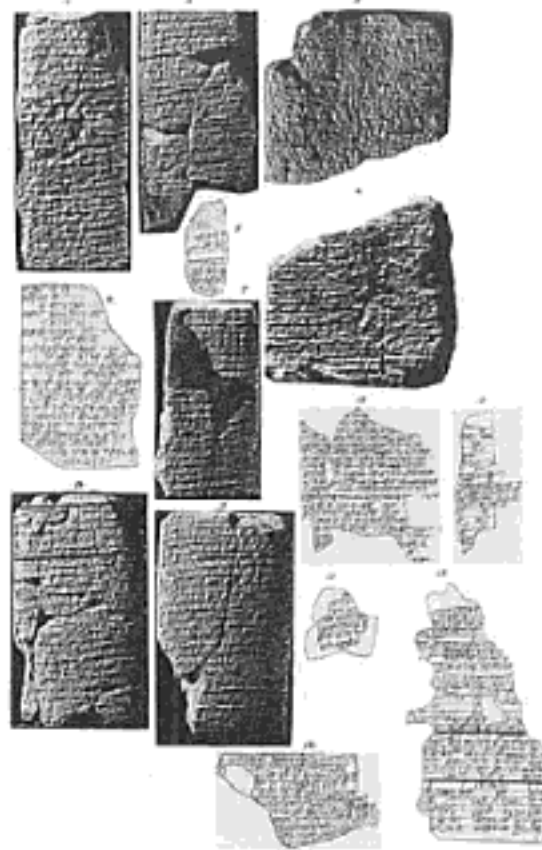
PLATE XX INANNA'S DESCENT TO THE NETHER WORLD (For description, see opposite page.)

(This plate is arranged from Proceedings of the American Philosophical Society 85 (3), plates 1-10.)