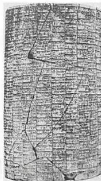
PLATE IV GUDEA CYLINDER (For description, see page 18.)