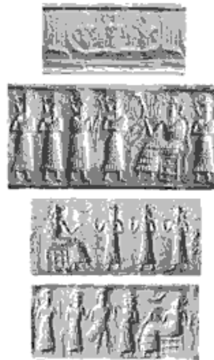
PLATE XIV ENKI, THE WATER-GOD (For description, see opposite page.)

(Reproduced, by permission of the Macmillan Company, from Henri Frankfort, Cylinder Seals , plates XXf, XXIe, and XXXIII d, f.)