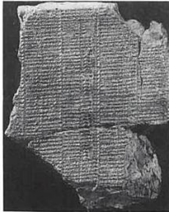
PLATE VI NIPPUR GRAMMATICAL TEXT (For description, see page 22)

two decades, largely as a result of Arno Poebel's Grundzüge der Sumerischen Grammatik 25 that Sumerian grammar has been put on a scientific basis. As for the lexical problems, these still remain serious and far from resolved. 26