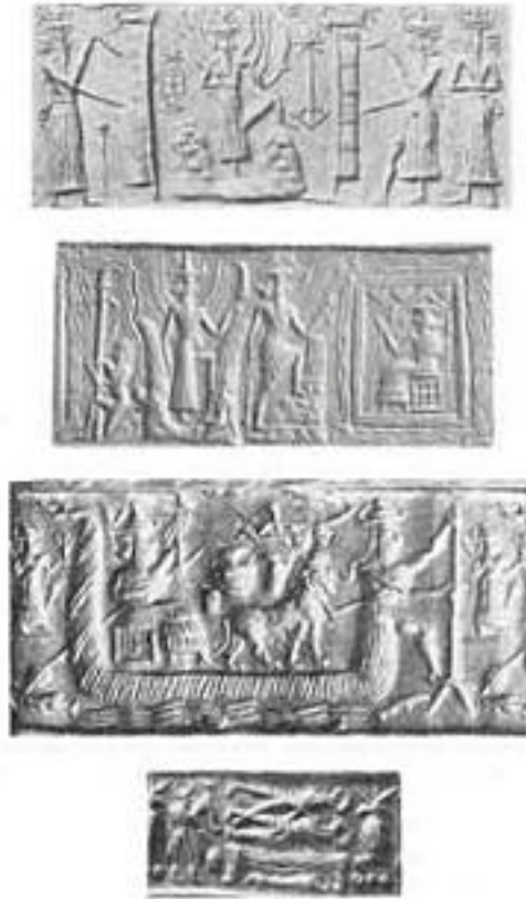
PLATE X MISCELLANEOUS MYTHOLOGICAL SCENES (For description, see opposite page.)

(Reproduced, by permission of the Macmillan Company, from Henri Frankfort, Cylinder Seals , plates XVIIIa, k, XIXe, and XVI.)