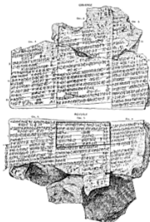
FIG. 2. THE DELUGE (For description, see opposite page.)