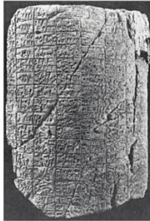
PLATE III NIPPUR ARCHAIC CYLINDER (For description, see opposite page.)

French Assyriologist, Thureau-Dangin, as early as the first decade of our century. 19 The Sumerological advance of the past several decades, however, makes a new translation imperative.