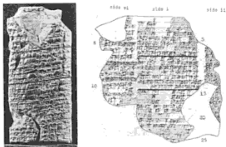
PLATE VIII. THE SEPARATION OF HEAVEN AND EARTH (For description, see opposite page)

The tablet (13877 in the Nippur collection of the University Museum) illustrated 38 here is one of the 20 duplicating pieces utilized to reconstruct the text of the poem, "The Creation of the Pickax" (see p. 51). Its first five lines are significant for the Sumerian concepts of the creation of the universe; for the translation and the transliteration, see page 40 and note 39.