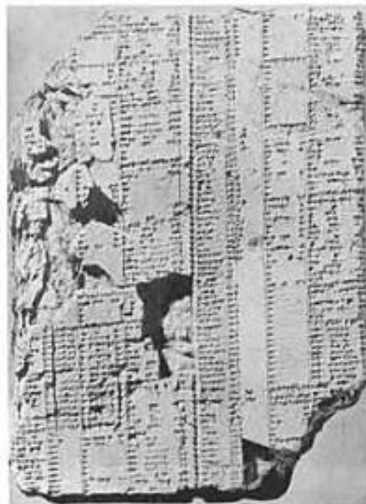
PLATE V "CHICAGO" SYLLABARY (For description, see opposite page.)

This plate (from Arno Poebel, Historical and Grammatical Texts (Philadelphia, 1914), pl. CXXII) illustrates another type of lexical text devised by the Semitic scribes to further their knowledge of Sumerian. It is primarily grammatical in character. The tablet originally contained 16 columns. Each column is subdivided into two halves. The left half contains a Sumerian grammatical unit, such as a substantive or verbal complex, while the right half gives its Semitic translation. This tablet is much older than the "Chicago" syllabary; it belongs to the same period as our literary material, approximately 2000 B. C. 24