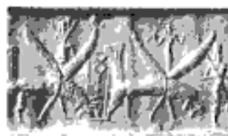
PLATE XIX GODS AND DRAGONS (for description, see opposite page.)