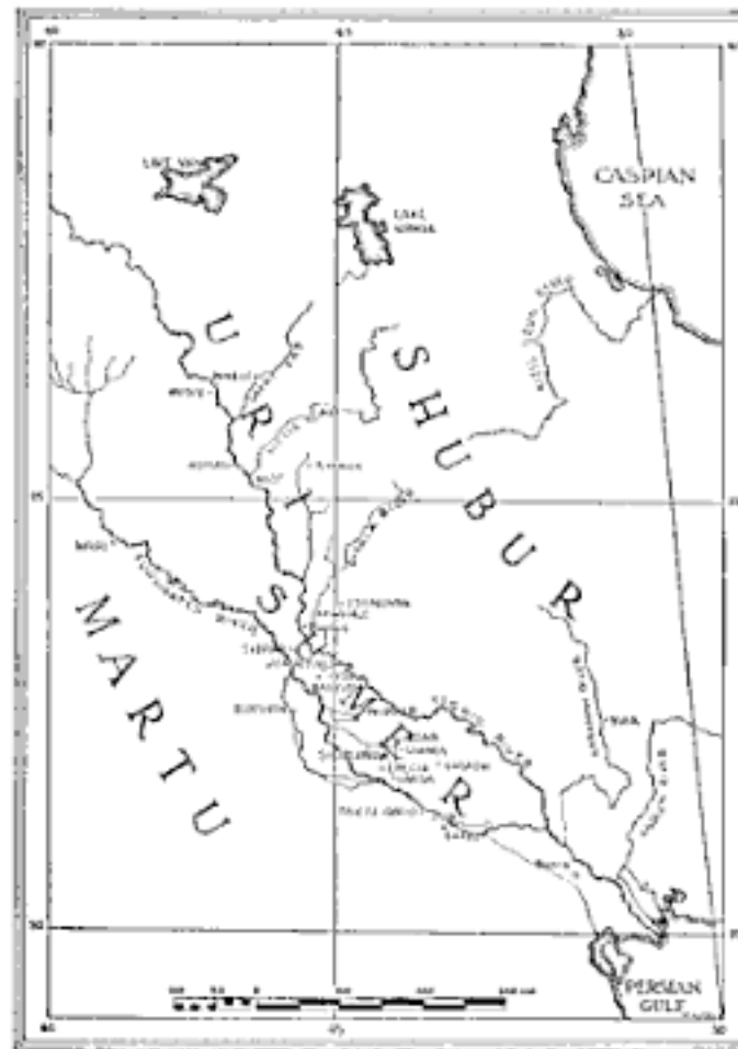
MAP 1. SUMER IN THE FIRST HALF OF THE THIRD MILLENNIUM B. C. (For description, see opposite page.)

(Map drawn by Marie Strobel, after one facing page 643 in Handbuch der Archäologie (München, 1939).)