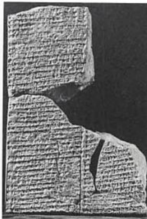
PLATE XVIII THE CREATION OF MAN (For description, see page 70.)