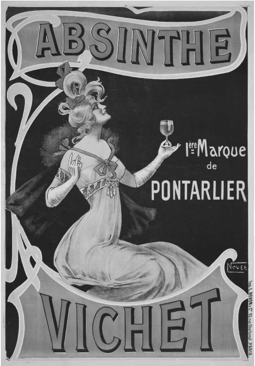
Figure 4.3 Posture (19th c.) Absinthe Vichet by Nover.