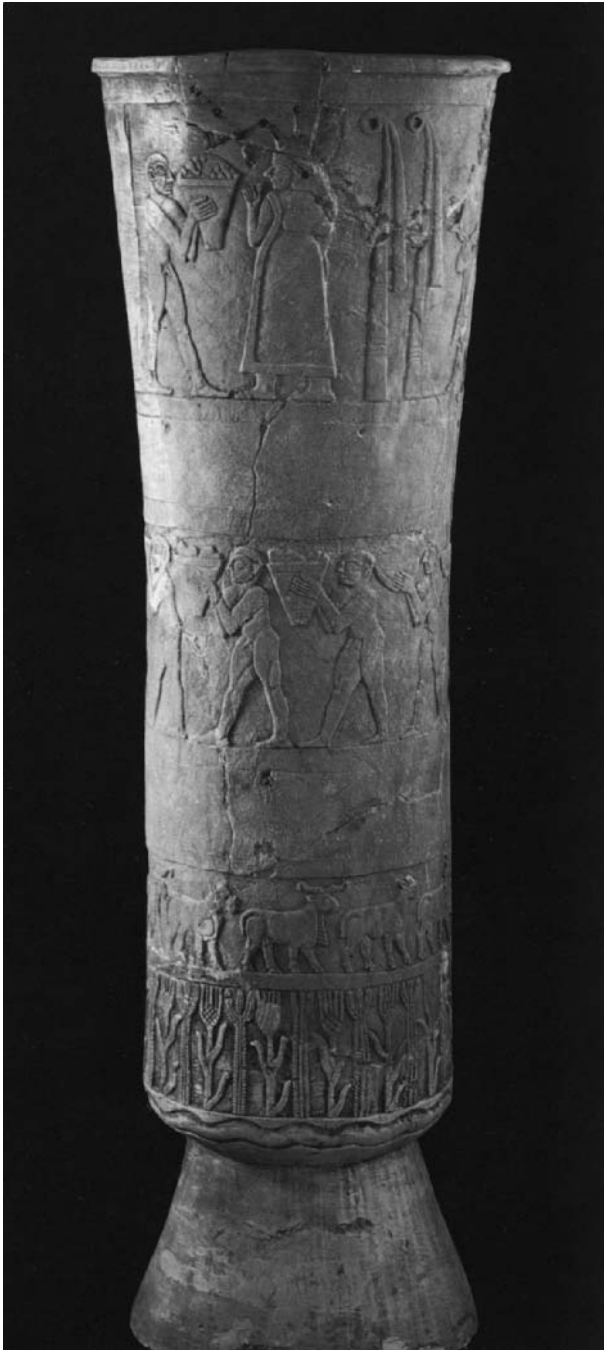
Figure 1.1 Uruk Vase (ca. 3100 BCE) before 2002 looting; top panel, Inanna standing before reed doors of storehouse temple; second panel, processional of offerings; third, rams for sacrifice; bottom, alternating grain and pomegranates.