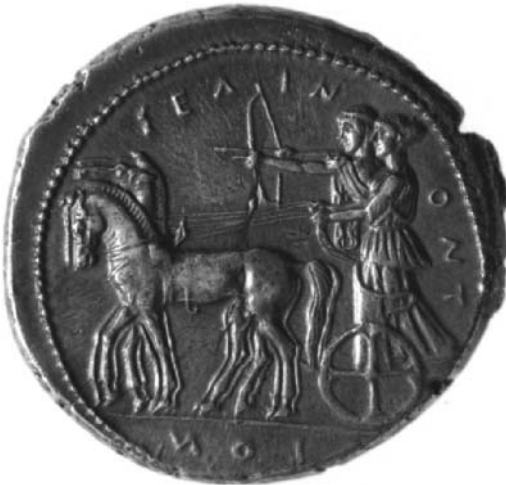
Figure 4.1 Selinus coin depicting Artemis driving chariot and beside Apollo shooting arrows to defend city against malaria.