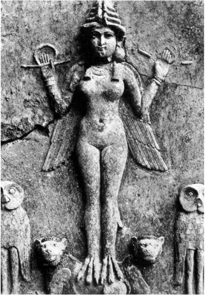
Figure 6.1 Lilith with owls and lions on each side on a Babylonian cult plaque, ca. 1950 BCE.

Source: The Burney Relief, The Granger Collection, New York (0017755).