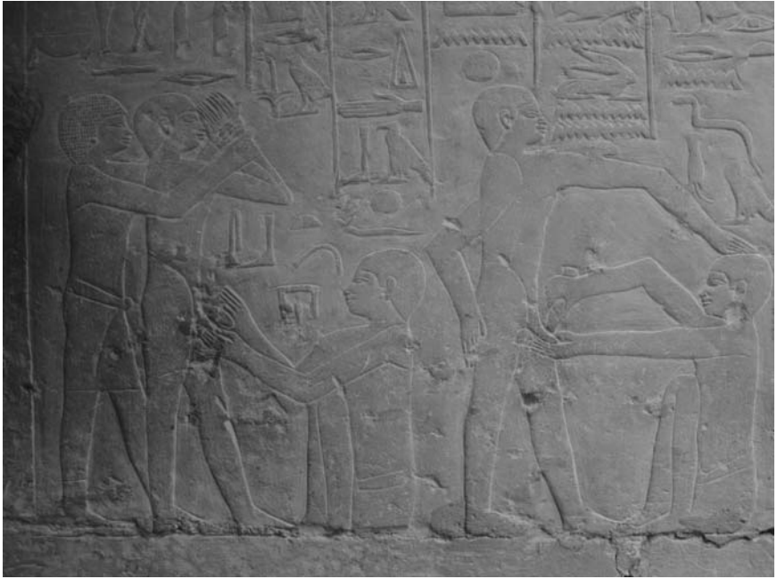
Figure 5. 1 Egyptian circumcision procedure from tomb of a vizier to the Pharaoh Teti (ca. 2300 BCE) at Sakkara, 6th Dynasty.