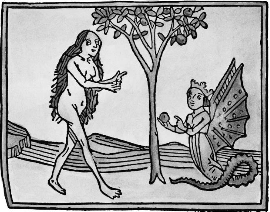
Figure 6.2 Lilith tempting Eve with an apple in the Garden of Eden.

Source: Woodcut, German, 1470. The Granger Collection, New York (0044522).