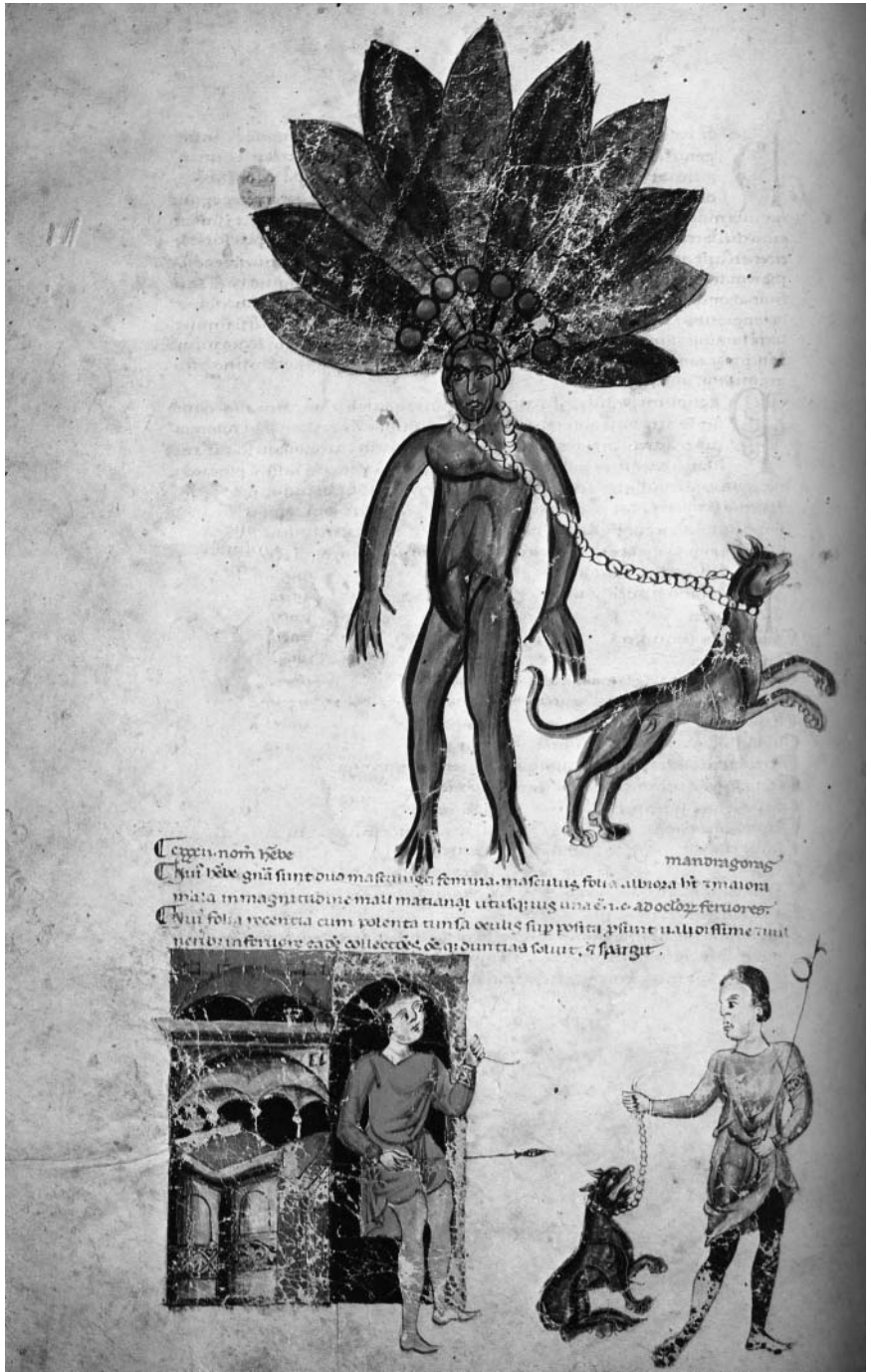
Figure 3.1 Mandrake uprooted by dog on chain.