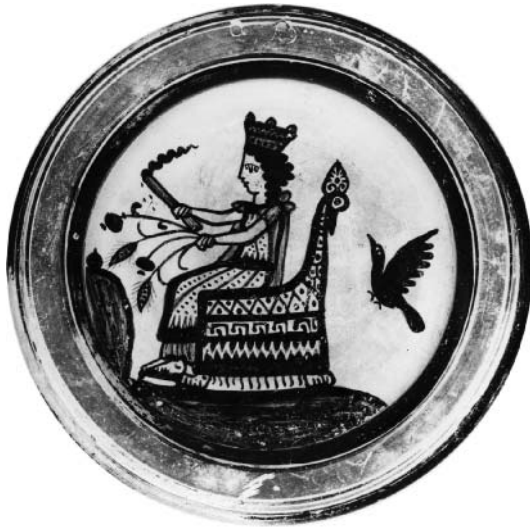
Figure 2.1 Boeotia plate (5th c. BCE) showing Demeter (possibly Persephone) seated holding torch in right hand and in left grain and pomegranates.

The connection between Inanna and Persephone/Demeter is clearly seen on a vase, the Demeter Vase. A picture drawn on a Boeotian plate (see figure 2.1) shows either Demeter or Persephone (some say both in one) seated, enthroned and heavily draped. The figure's right hand holds a torch; her left holds two stalks of grain and two twigs with a pomegranate on each end. The torch in her right hand is, in Demeter's words to Persephone (placed there by Claudianus): "I had thought—of the wedding torch I'd hold to light your way from a happy nuptial feast to the bridal chamber and bed and the start of a decent life." 89 With her left hand, she holds the grain and pomegranates on an omphalos altar on which there is what appears to be a pomegranate. 90 The goddess holds the symbols for fertility and sterility. She controls each in her hand. Demeter's symbols are clear. 91 The juxtaposition of grain and pomegranates on the Demeter Vase is exactly the same as that on the Uruk Vase; the Demeter vase was almost 3,000 years after the Uruk Vase.