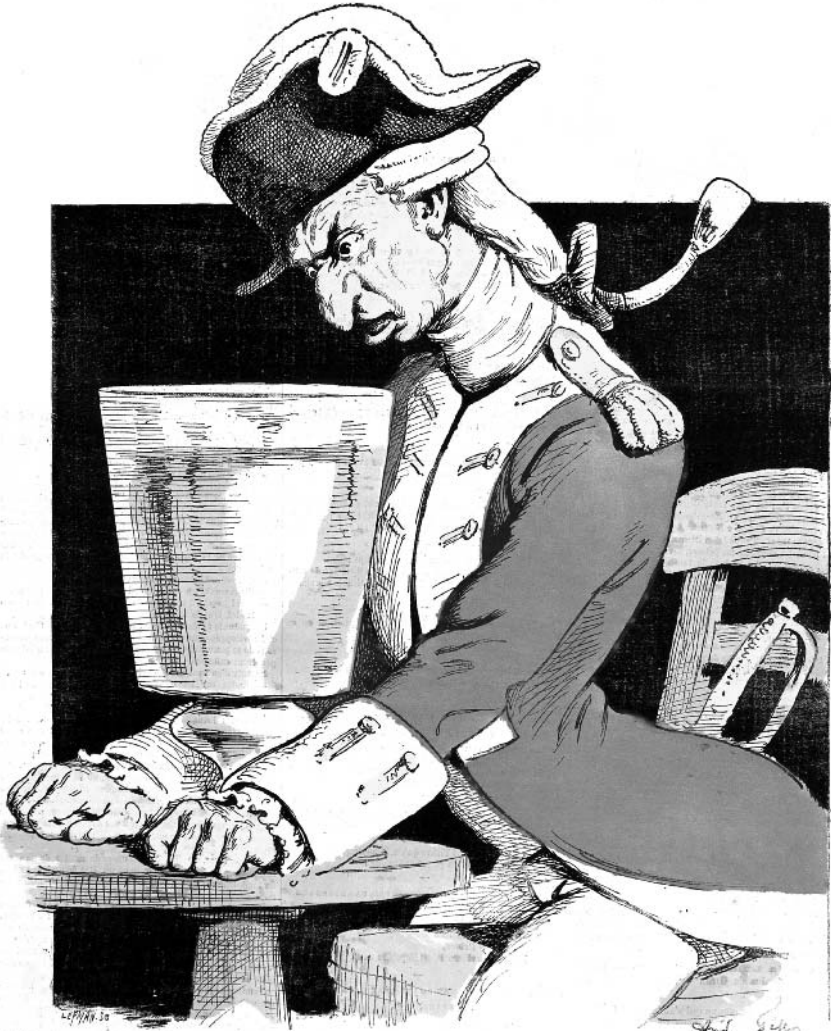
Voir au dos les vers de Gill.