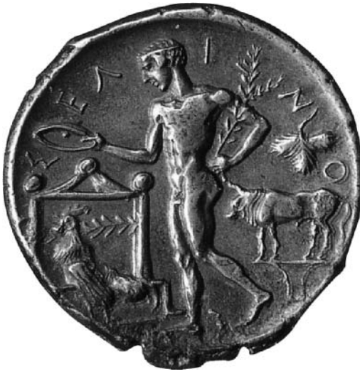
Figure 4.2 Obverse of Selinus coin.