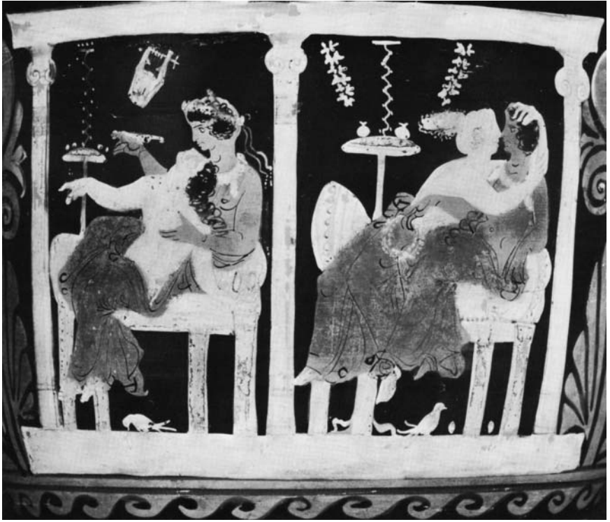
Figure 2.2 Roman love scene with pomegranates on stand within easy reach.