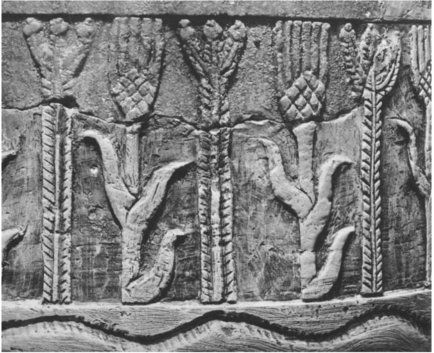
Figure 1.2 Lower panel of Uruk vase showing alternate stalks of grain and limbs each bearing three pomegranates.