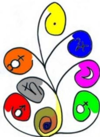
Ordine Scatere Stellae

ABRAHADABRA ABRAHADABR ABRAHADAB ABRAHADA ABRAHAD ABRAHA ABRAH ABRA ABA AB A