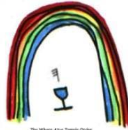
The White Adept Temple Order