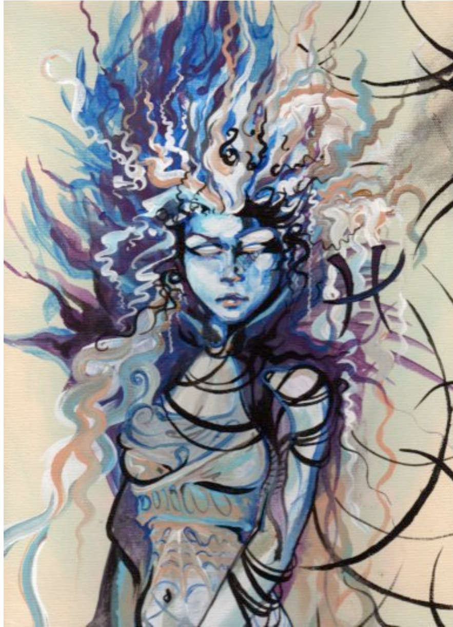
“Venus in Pisces”