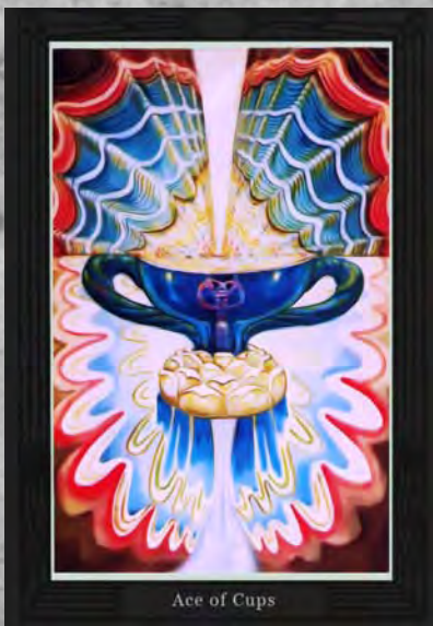
Ace of Cups