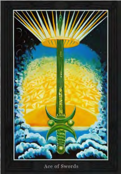
Ace of Swords