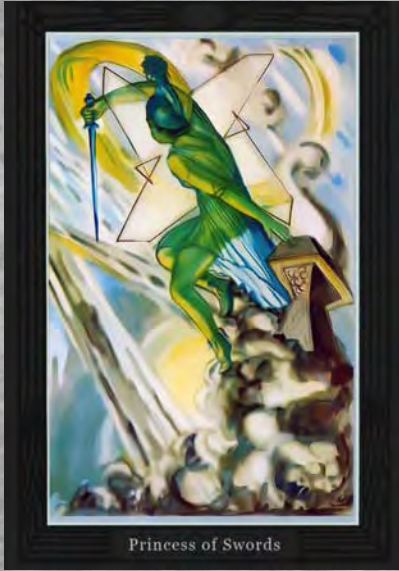
Princess of Swords