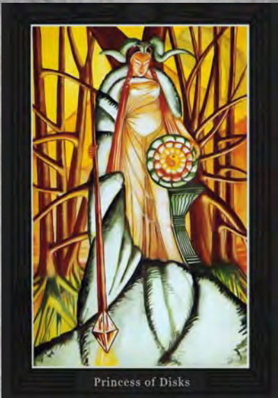
Princess of Disks