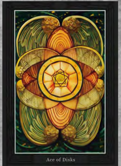
Ace of Disks