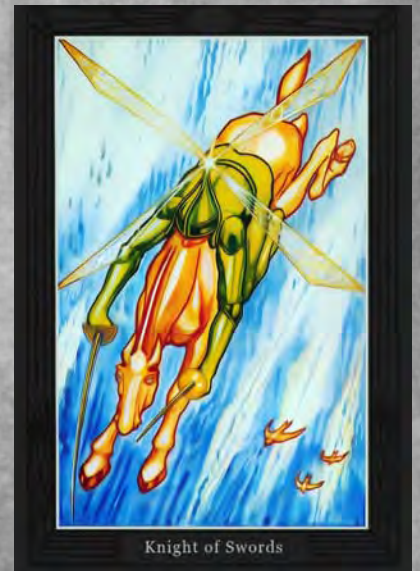
Knight of Swords