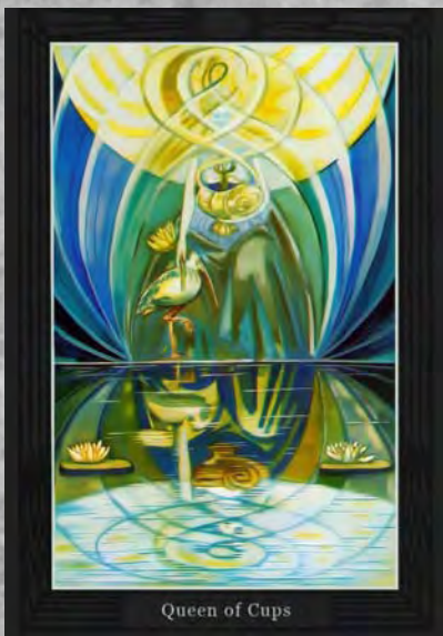
Queen of Cups