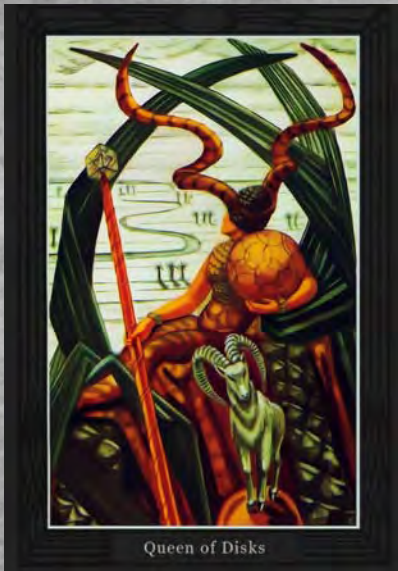
Queen of Disks