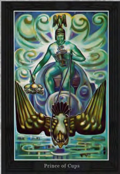
Prince of Cups