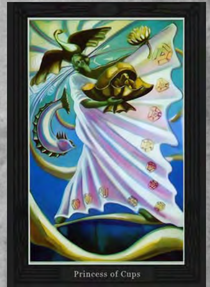
Princess of Cups