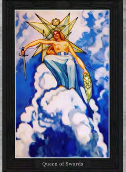
Queen of Swords