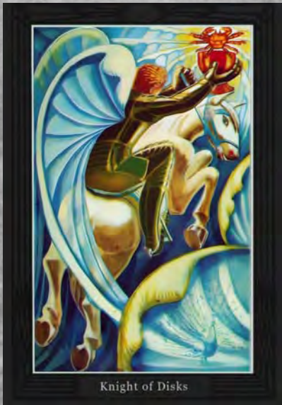
Knight of Disks