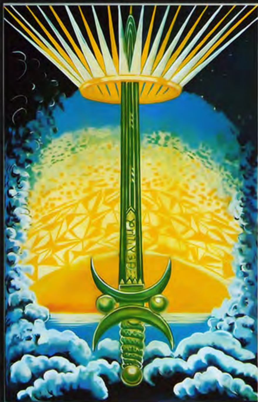
Ace of Swords