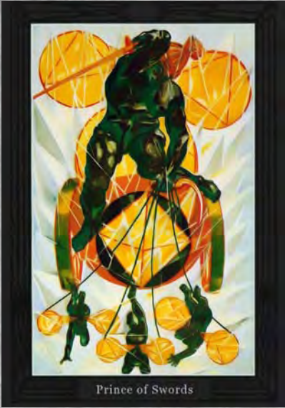
Prince of Swords