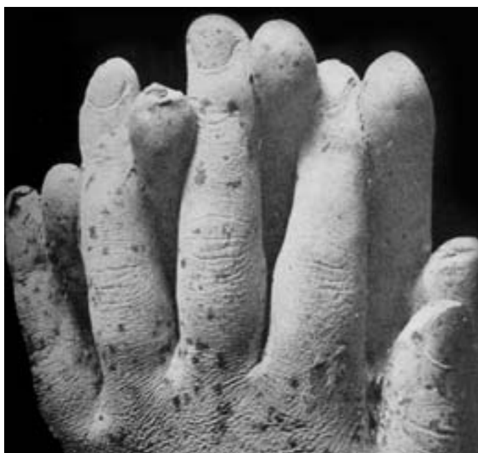
Front cover photograph, A plaster cast from a Paraffin wax mould of spirit hands taken from spirit hands materialised in séance room through the mediumship of Polish medium Franek Kluski.