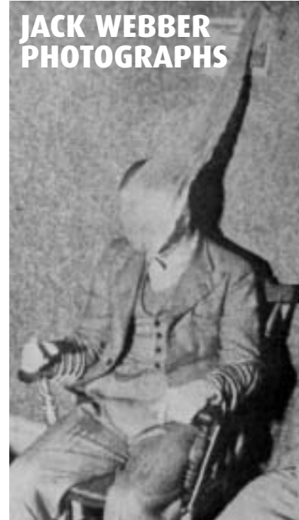
Plate 29. Length of ectoplasmic material taken upwards and backwards to wall.