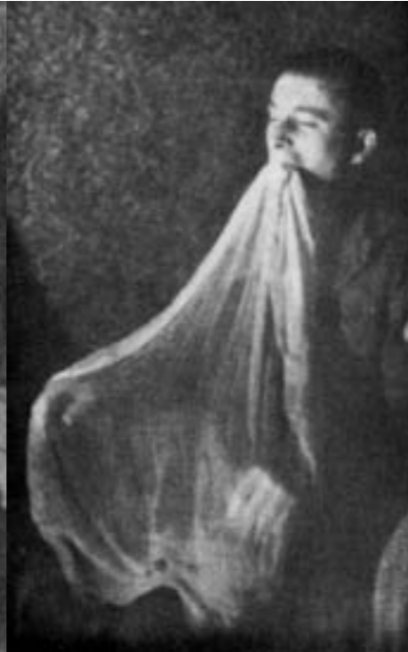
Plate 33. Side view of ectoplasmic material.