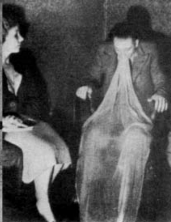
Plate 32. Length of ectoplasm over five yards long.