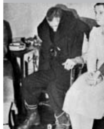
Plate 5. The coat, entirely removed, is in front of the medium's body. Note the unruffled hair, the stitching of the coat and the roping of arms at elbows.

Plate 4. The coat sleeves have been removed from the body and coat is being drawn over the head.