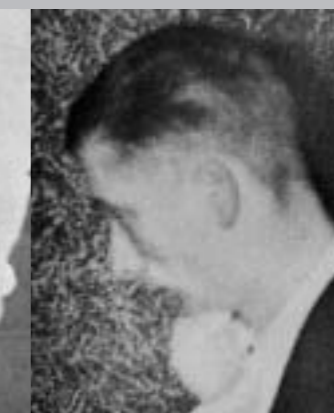
Plate 26. This formation, with source of emergence below the neck, was photographed while the medium was not in trance.

Plate 17. Voice box with ectoplasmic arm. Note the merging of ectoplasmic surround into throat.