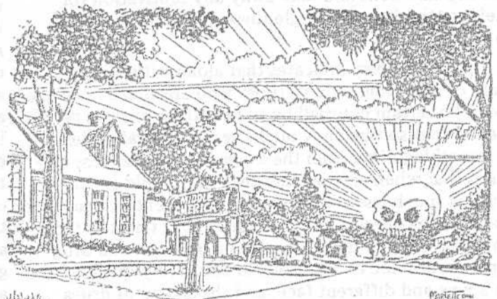
THE DAWN OF CRACK

These drugs of this age are totally different from they psychedelics of the sixties which brought feelings of love and compassion between most of those entities indulging at that time. These drugs create cold hard and hostile feelings and feelings associates with power and contempt for others. It is extremely dangerous to your society.