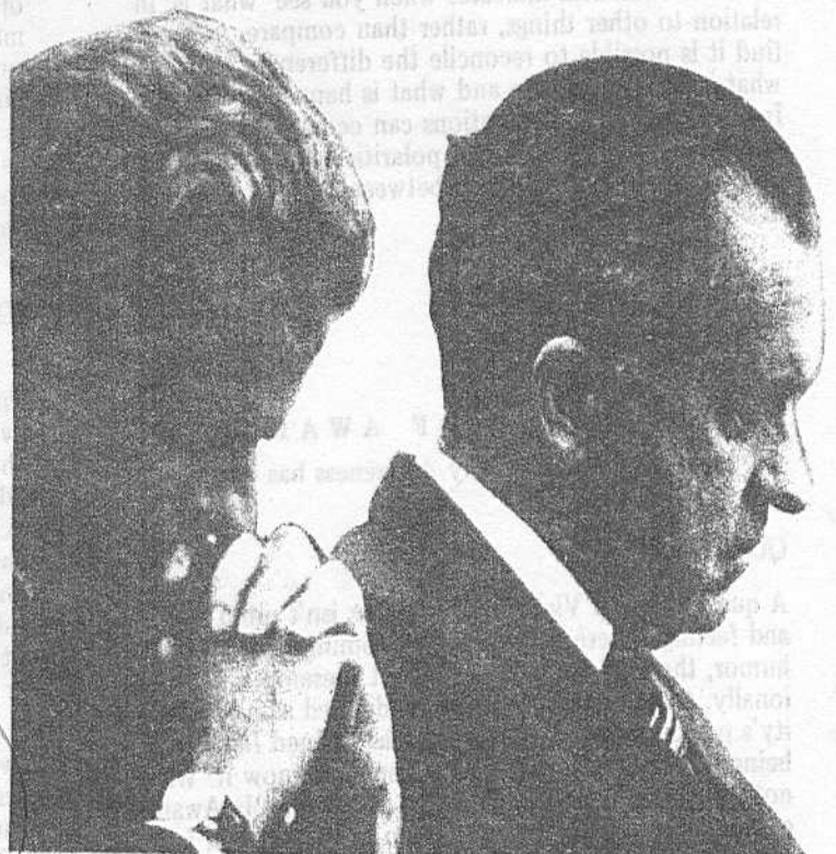
1970: The Rev. Billy Graham with President Nixon. ( Fearing God together )

* Young Billy as he appeared in 1940 upon his graduation from Florida Bible Institute.