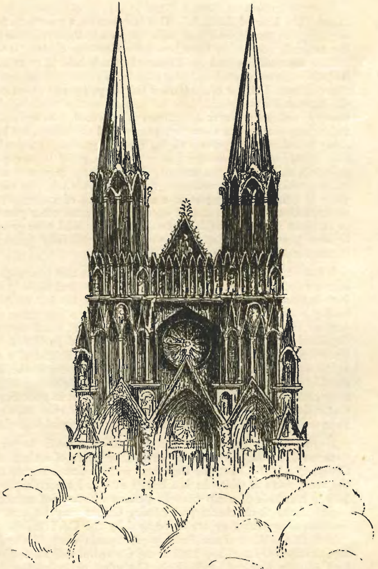
(A Symbol drawn by the Emperor)