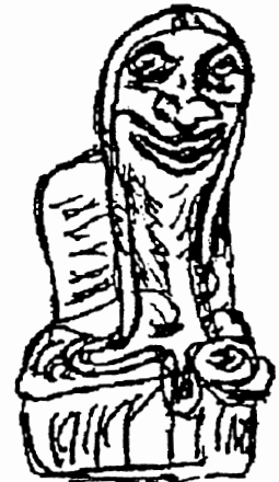
Crouching Hooded Power Gargoyle 5" Members $14.00 Non-Members $17.00