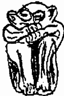
Little Protector 2 3/4" Members $6.00 Non-Members $8.00