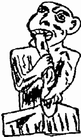
Gnawing Gargoyle of Protection 5" Members $14.00 Non-Members $17.00