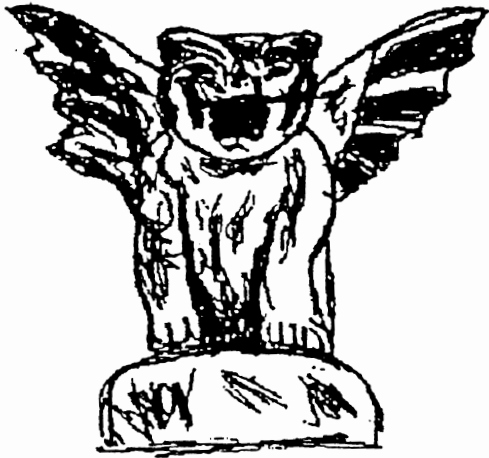
Seen all over Europes fine buildings. The Winged Dog of Protection. 5 3/4". Members $15.00 Non-Members $18.00

You can now own one of these fantastic figures at a low price!!