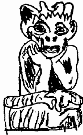
Moping Angel of Power. 5 1/2" . No home should be without one!! Members $14.00 Non-Members $17.00

Gargoyles have been used for hundreds of years to protect home and other important buildings! Just having them around gives you a sense of protection and power!! Try them for yourself!!