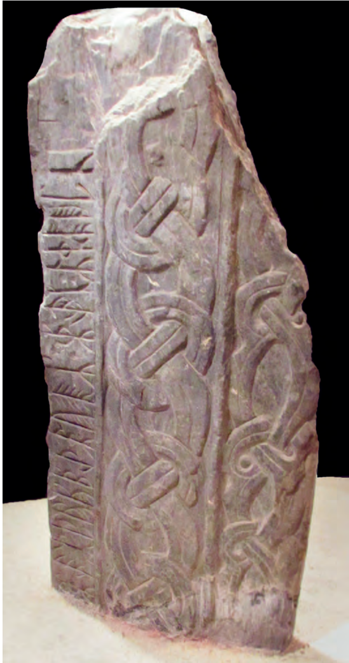
Fig. 5. Andreas 111.