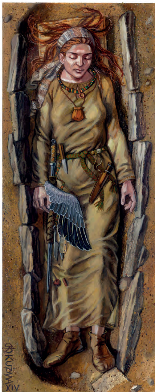
Fig. 11. Artistic reconstruction of the 'Pagan Lady' grave. Drawing by Mirosław Kuźma.