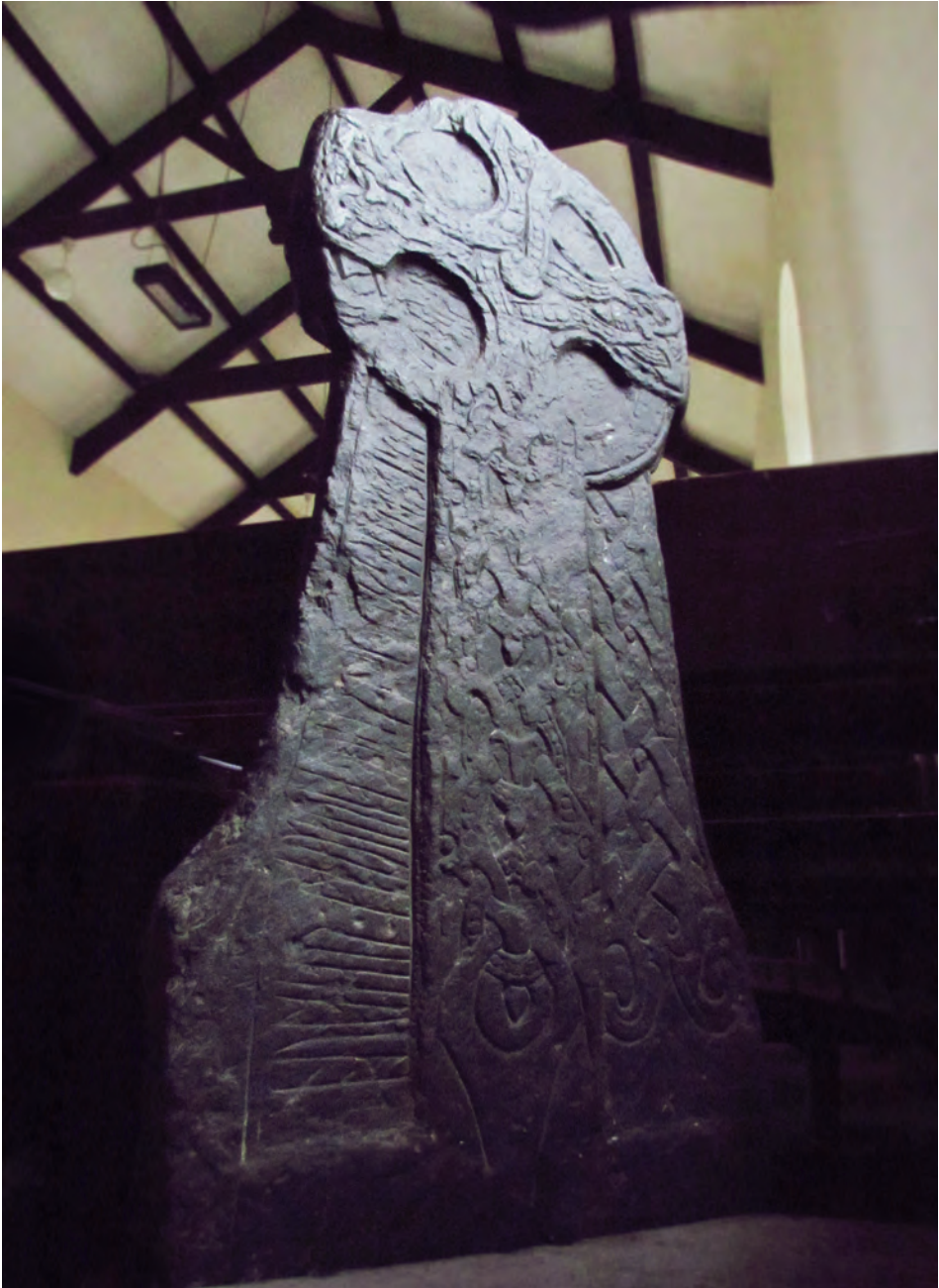
Fig. 4. Ballaugh 106.