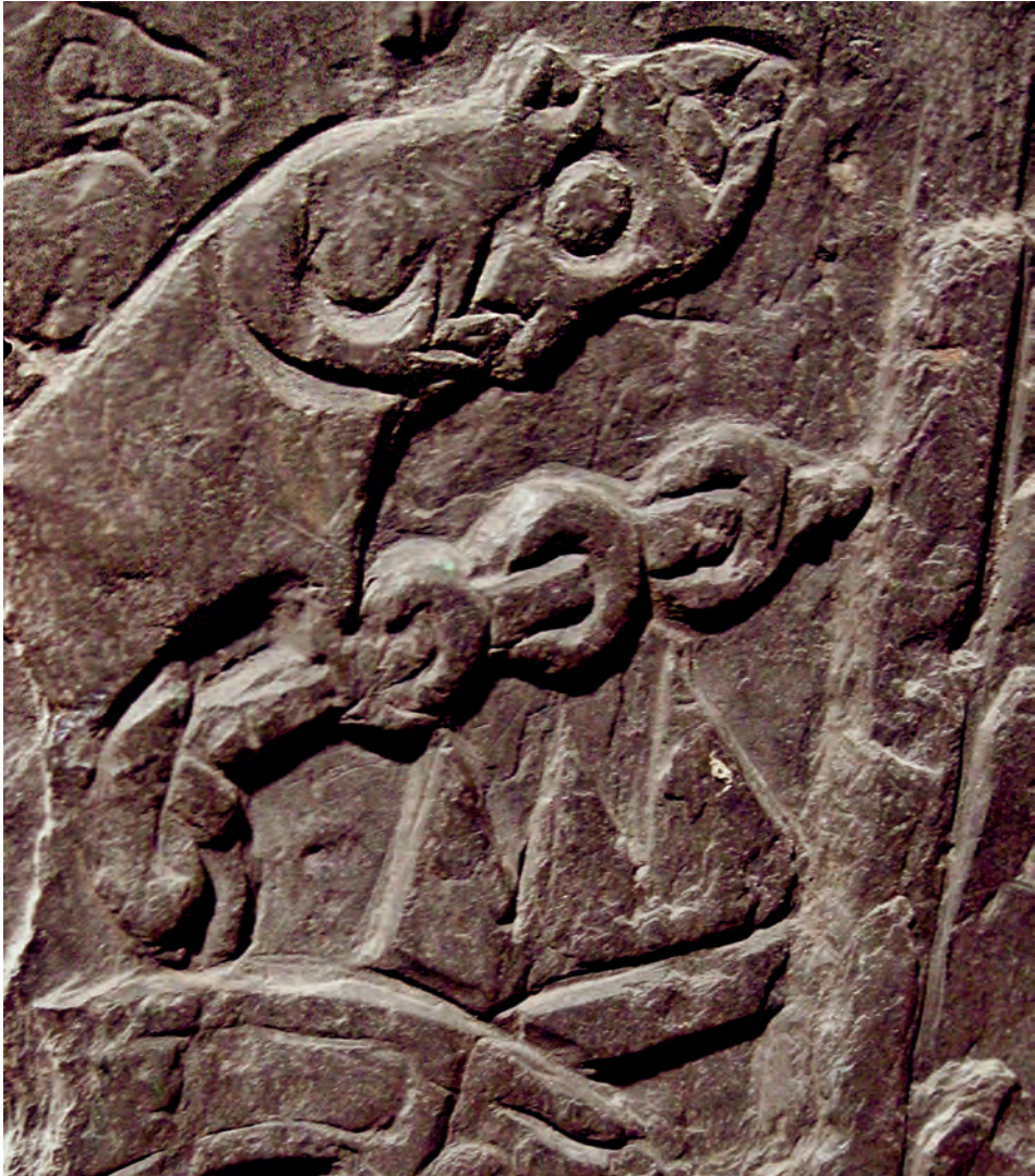
Fig. 9. Andreas 121.

going to die in battle and bring them to Valhalla, the hall of the slain, ruled over by Odin. In the eddic poem Volund's poem , three valkyries are said to have swan-garments that allow them to fly and they sit on a lake-shore to spin linen. A third possibility is that these images represent figures of fate, sometimes called norns: female beings who established the laws and chose people's fates.