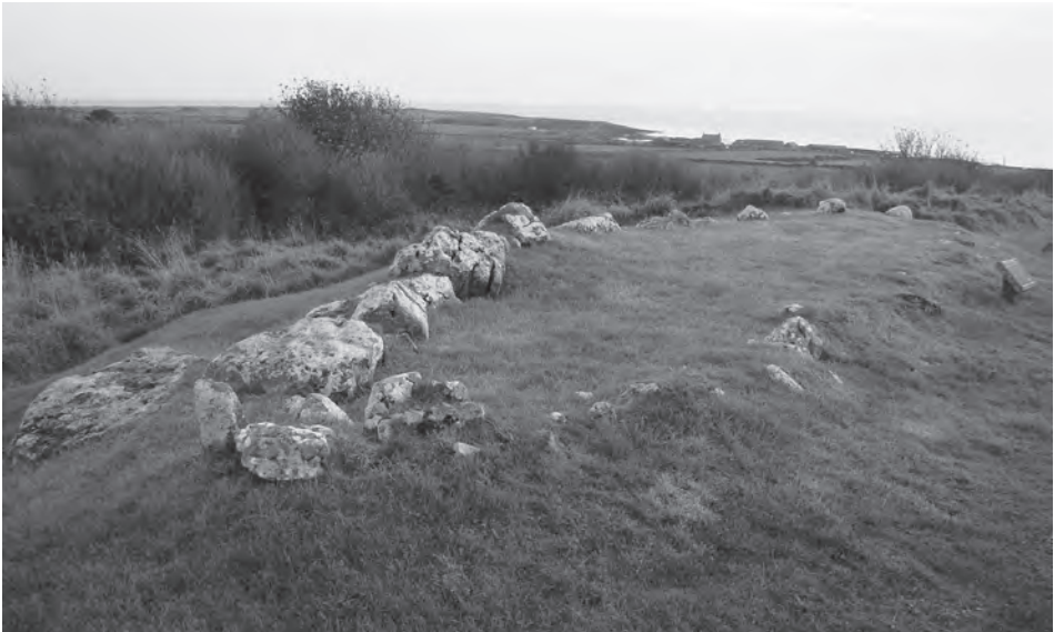
Fig. 3. The Balladoole grave.

dating to the 9 th –10 th century was found. The boat was originally around 11m long and contained the body of an adult man accompanied by a wide array of high-status objects (see Chapter 5 for further details). Many of these splendid finds can be seen in the Manx Museum, but the actual site of the burial is well worth visiting as it lies on top of Chapel Hill, occupying a prominent position in the landscape and offering a magnificent view of the Irish Sea coast. Today the exact location of the boat grave has been outlined by stones. Visitors to the site can also see other archaeological features, such as the remains of a Celtic rampart and an early Christian chapel. ( fig. 3 )