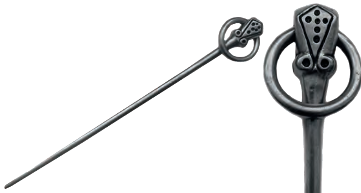
Fig. 12. Replica of the Ballateare ringed-pin by Grzegorz 'Greg' Pilarczyk and Kamil Stachowiak. Commissioned by Leszek Gardela.