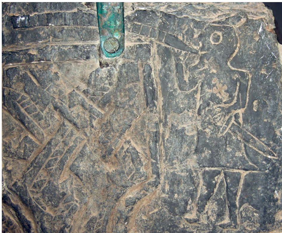
Fig. 7. Jurby 127.

This is also known as ‘Thor’s Cross’; some researchers have seen various myths involving the god Thor in its ornamentation. On one side of the cross, below the circle to the right, a man with a beard and a belt is depicted who might be Thor, the red-bearded god. Thor is the son of Odin and Jord (Earth), the guardian of the gods, and