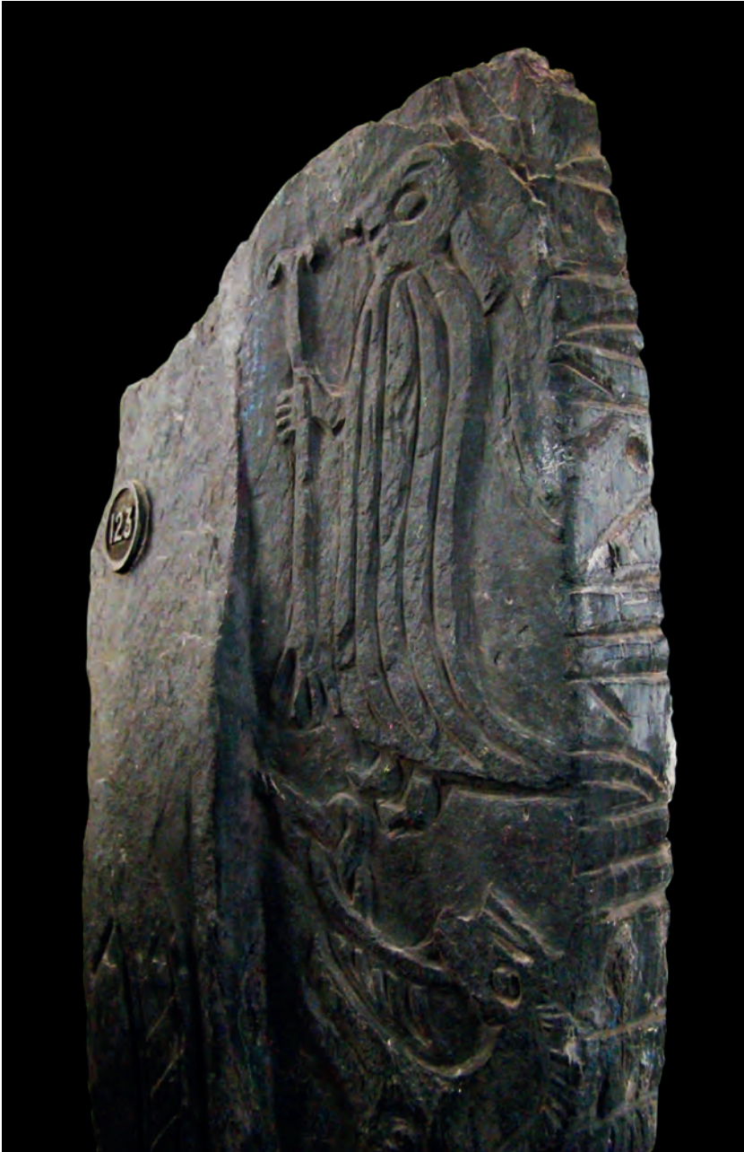
Fig. 8. Michael 123.