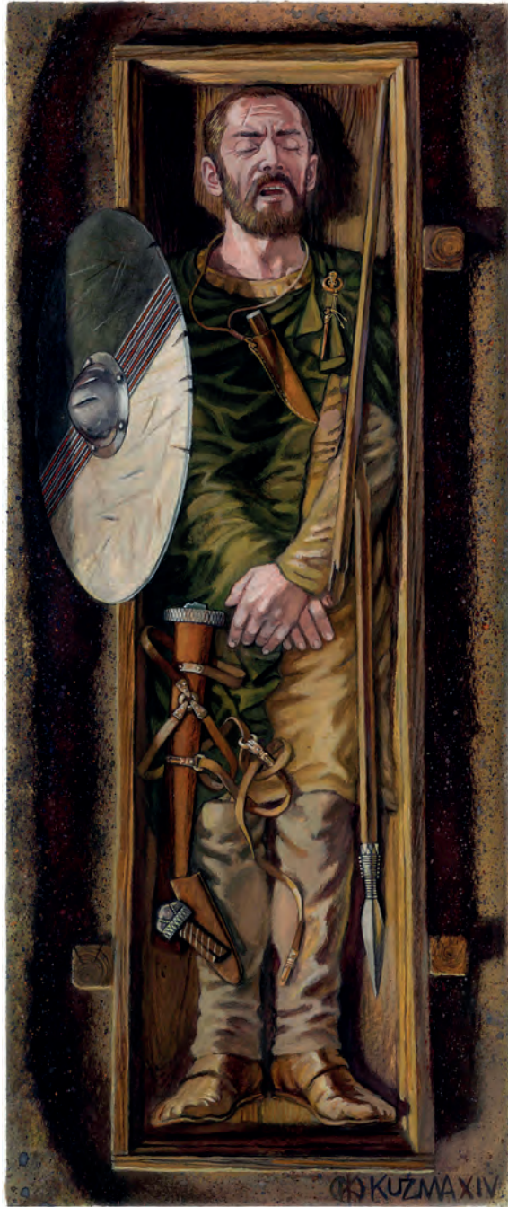
Fig. 10. Artistic reconstruction of the Ballateare grave. Drawing by Mirosław Kuźma. © Leszek Gardela and Mirosław Kuźma.