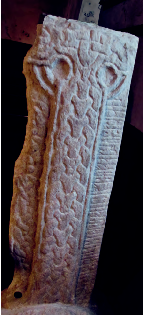
Fig. 2. Braddan 112.