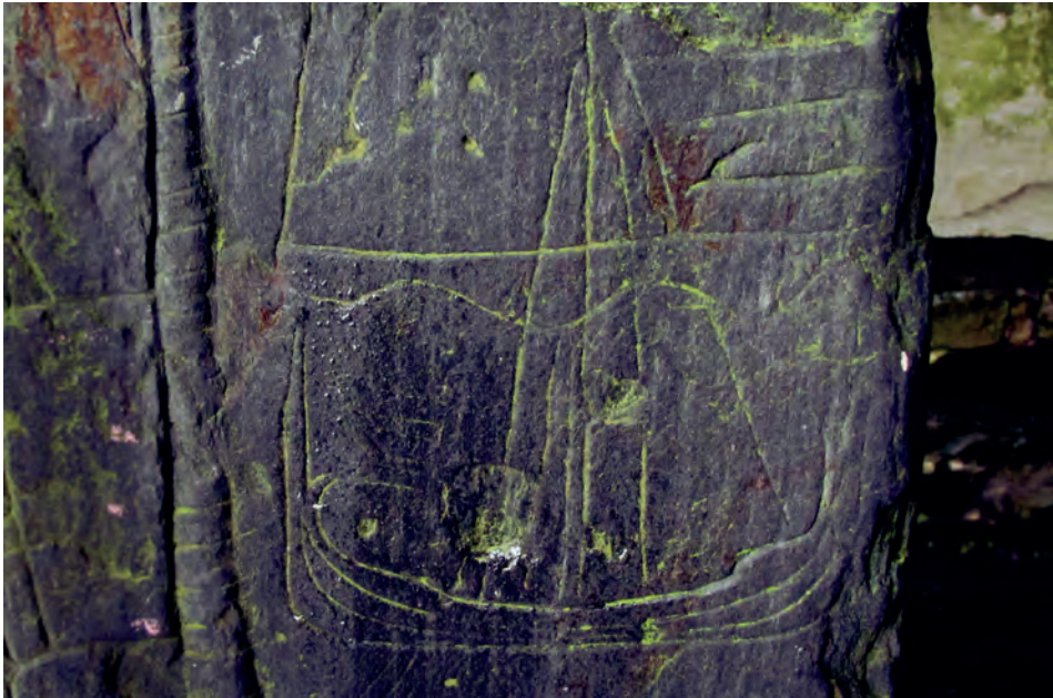
Fig. 6. Maughold 142.

The cultural richness of these stones and their inscriptions is unique to the Isle of Man, and are some of the many reasons that make the Island well worth studying and exploring.