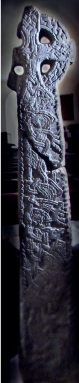
Fig. 1. Braddan 135.