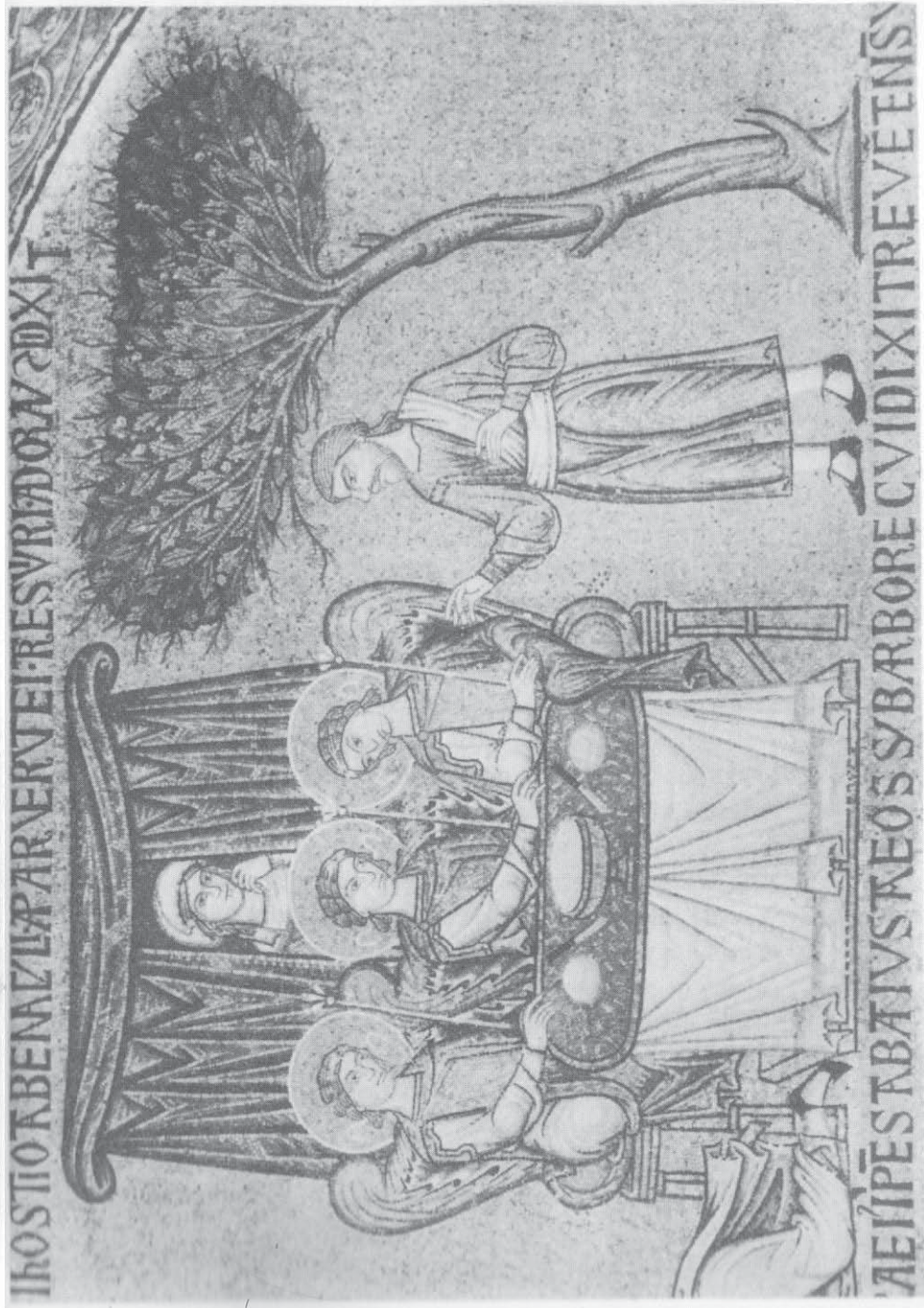
3 The Philozeny of Abraham

Detail from a mosaic, Cathedral of St. Mark, Venice, thirteenth century