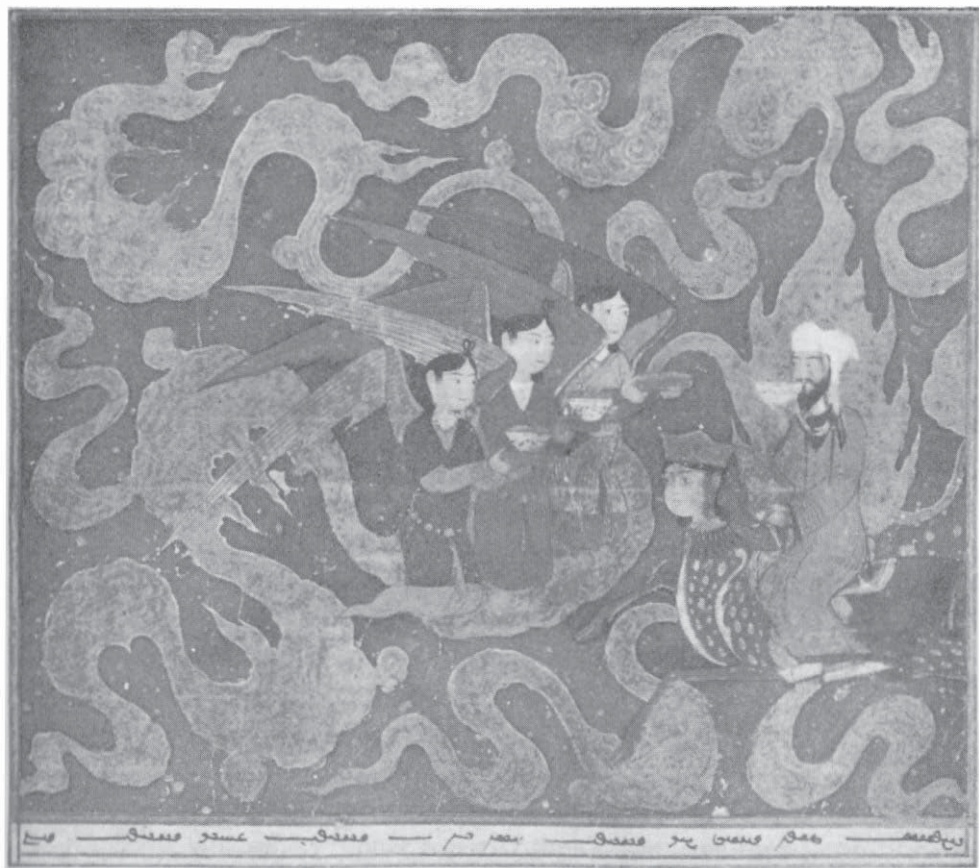
4 Three Angels Offering Three Cups to the Prophet Bibliothèque nationale, Paris, MS supplément turc 190