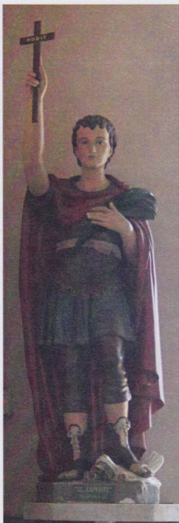
OUR LADY OF GUADALUPE CHURCH, NEW ORLEANS. ALCOVE WITH STATUE OF ST. EXPEDITE.