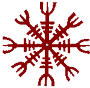
Aegishjalmur protection, irresistibility in battle