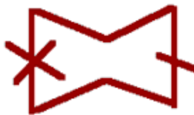
Powerful binding of prisoner