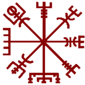
Vegvisir Runic compass prevent getting lost