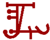
Odin's Illusionary Rune Camouflage & deception