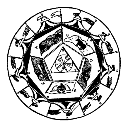
Seal Showing the Camp — 1832

Now, to reiterate: These unanswered queries have nothing to do with the Scottish Rite, as of today, which is primarily based on the 1762-1786 Constitutions. There is nothing unusual about taking existing constitutions of a similar body or group and using them to base the laws of a newly organized body upon. Have not religious groups done likewise (the laws of Moses, for instance), taking them from a book (the Bible) which has no proof of authorship, no signatures and no originals. The newly-created Charleston Supreme Council, 33° simply adopted, with minor changes, these Constitutions and all succeeding recognized Supreme Councils have done likewise.