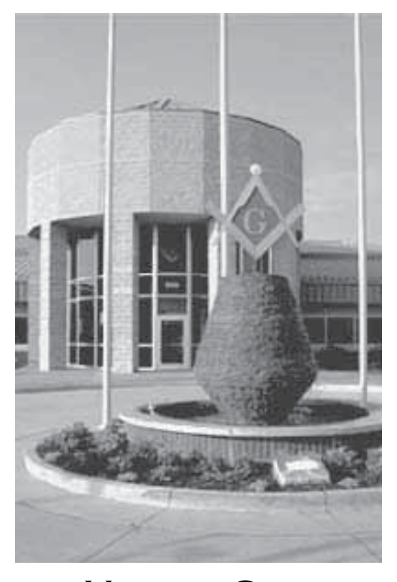
THE MASONIC COMPLEX 6033 MASONIC DRIVE COLUMBIA, MO 65202

ELMER E. REVELLE GRAND MASTER (2004-2005)