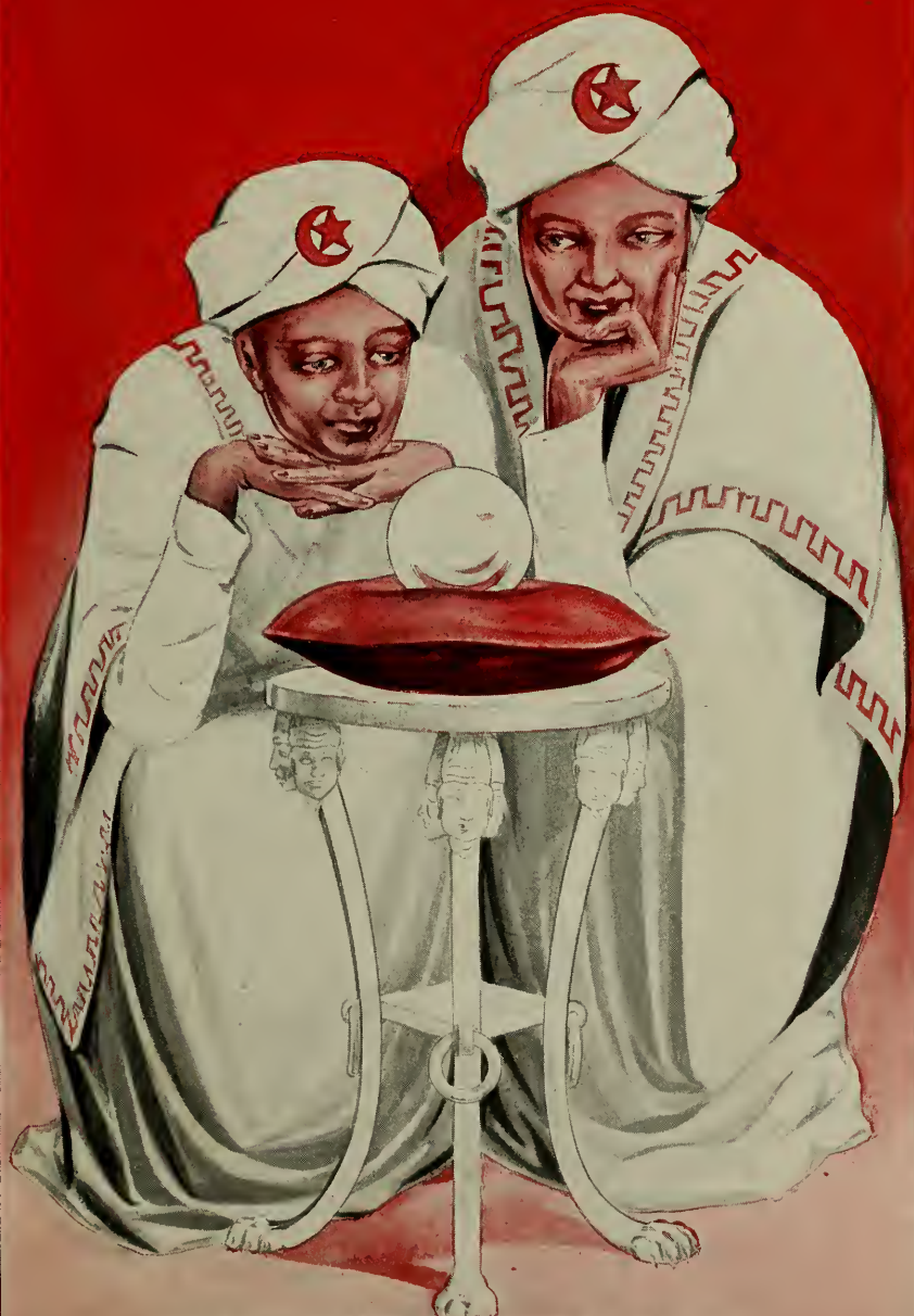
HINDU AND EGYPTIAN CRYSTAL GAZING.