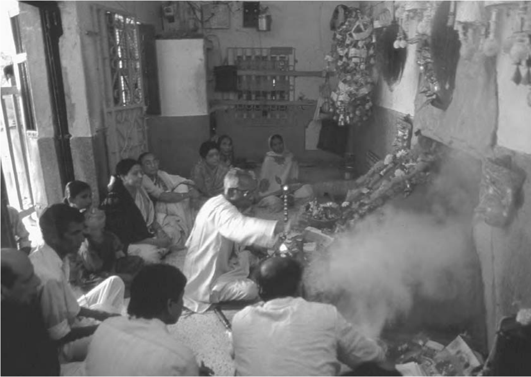
Pûjâ is worship, devotion, service to the divine, and a means to acquiring merit.