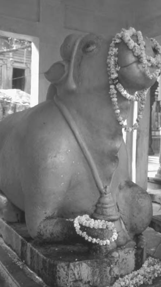
Nandi is Śiva's vâhana, his vehicle or mount.

In their next birth the two brothers became two trees in Ambâdi (Gokula) near the home of Śrî Krishna. One day as baby Krishna passed between the two trees, the two brothers received back their human forms.