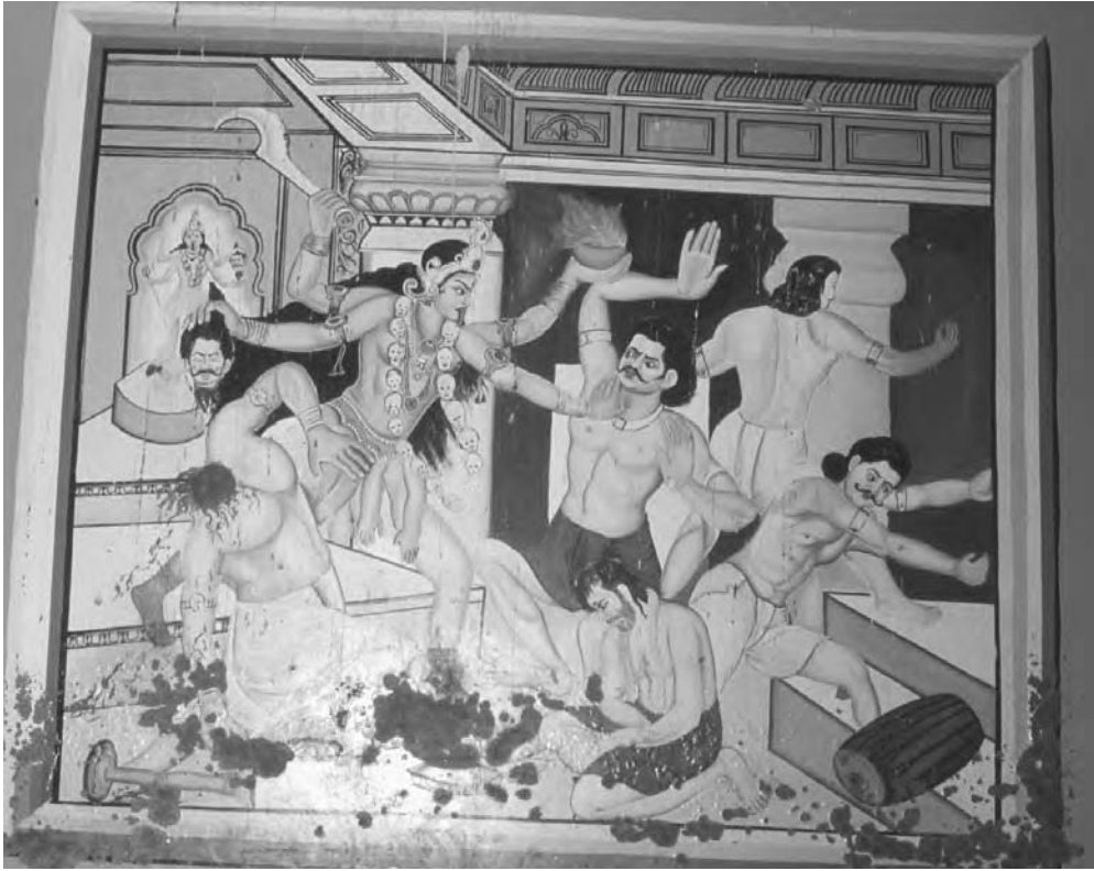
Devî manifests in many ways; here she kills yet more personifications of evil. (TRIP)