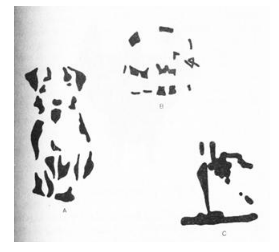
Figure 5. 1. Incomplete figures

It also is easier to perceive the familiar than the unfa-miliar. Study Figure 5.1 until you have identified all three elements. How long did it take you to identify each of the three figures? You probably identified the dog first, then the ship, and finally the elephant. This corresponds to the relative familiarity of the three images. The fa-miliar, of course, is the expected.