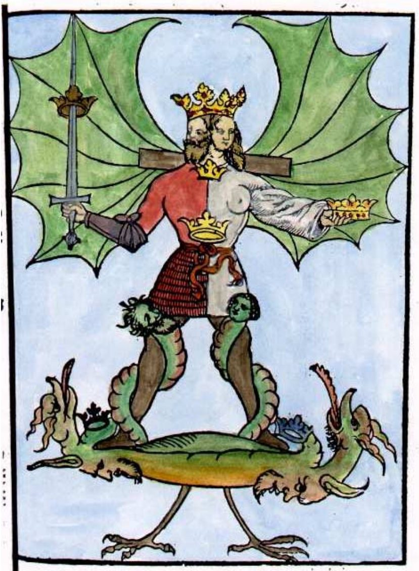
Let us now proceed to look at some examples of emblems in which animal symbols play a significant part. In these exercises, you should identify all the animal forms, and also try and see if they are placed within a particular part of the space of the emblem. See if there is a clear and definite animal symbol around which the emblem focusses. This may not necessarily be in the exact centre of the emblem. Try to see if the same animal symbols might reflect different aspects of the alchemical work in different emblems. "A rose is a rose is a rose" said Gertrude Stein, but in alchemy the symbol of a lion (or whatever) may not always represent the same thing alchemically. It is very difficult for some people to accept this, but it is the key to understanding alchemical symbolism. We cannot just draw up a simple dictionary and look up the meaning of a symbol. Instead we have to view each symbol in an emblem in the context of that emblem space. If there were a simple system of meanings assigned to each symbol then alchemy would have been exhausted and explained years ago. That is why in the early lessons of this course we had to lay the foundations for exploring the geometry and polarities of emblems, instead of jumping straight into individual symbols. You will see the value of having these foundations, when, later in this course, you are able to integrate all these approaches together, and begin to have the tools to analyse clearly the content of alchemical emblems.