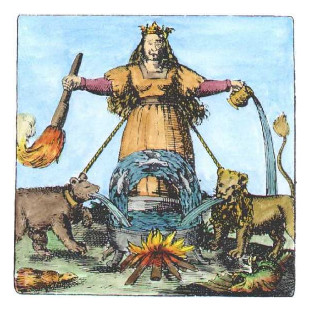
Example 1. Azoth series emblem 13.