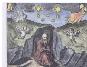
Study Course on alchemical sequences

This course explores in detail the individual symbols that compose alchemical emblems and develops the ability to analyse and read alchemical emblems. It is a one year course consisting of 24 lessons to be studied on a two weekly schedule. A mass of graphic material and examples of emblems is contained in these lessons.