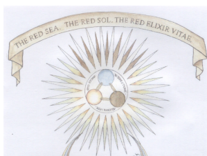
Study Course on the Ripley Scroll

linked together to illustrate a process. It is essential that one has already taken the foundation course as this advanced course builds on the ideas presented there. It is a one year course consisting of 16 lessons to be studied on a three weekly schedule. A great deal of graphic material is contained in these lessons.