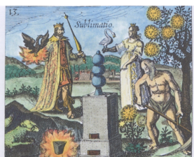
Study Course on alchemical symbolism

A growing suite of courses of instructions and exercises on the interpretation of alchemical symbolism and texts, which focus entirely on European alchemy. These are not correspondence courses, being entirely self contained, and do not require any additional materials. In addition the courses are very modestly priced.